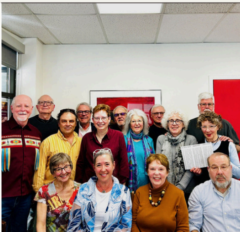
ON PHOTOGRAPHY DISCUSSION LEADERS AND PARTICIPANTS, 2025