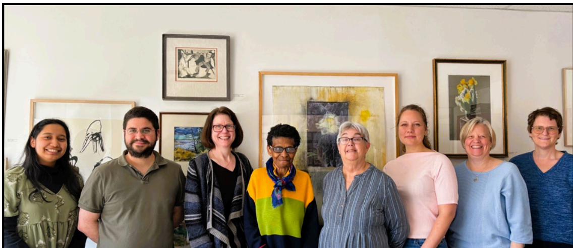
TMI Staff of 2025